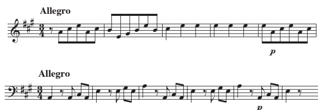
Figure 4: Violino Principale and Violoncello from the third movement of Vivaldi's Violin Concerto op. 3, no. 5

Even in this relatively simple texture we see immediately that the transcription is not consistently a skimming off of treble and bass but instead the product of a more complex process of selection, reflecting in part the alternation between the violins in the orchestral model.