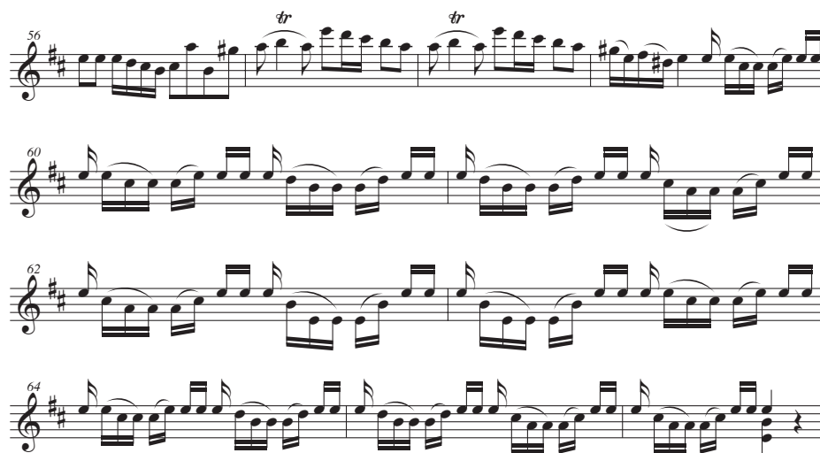
Figure 6: Unusual style of bowing indicated in Violino Principale of the first movement of Vivaldi's op. 8, no. 11

passages in which downward, upward, and mixed-direction arpeggios produce the most musical result (that is, the one most in keeping with voice-leading practices of the time) may be found.