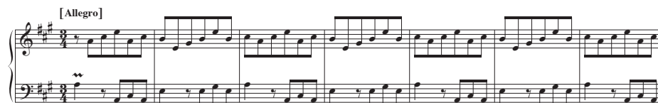
Figure 3: Transcription for clavichord of Vivaldi's Violin Concerto op. 3, no. 5, third movement, from Anne Dawson's Book