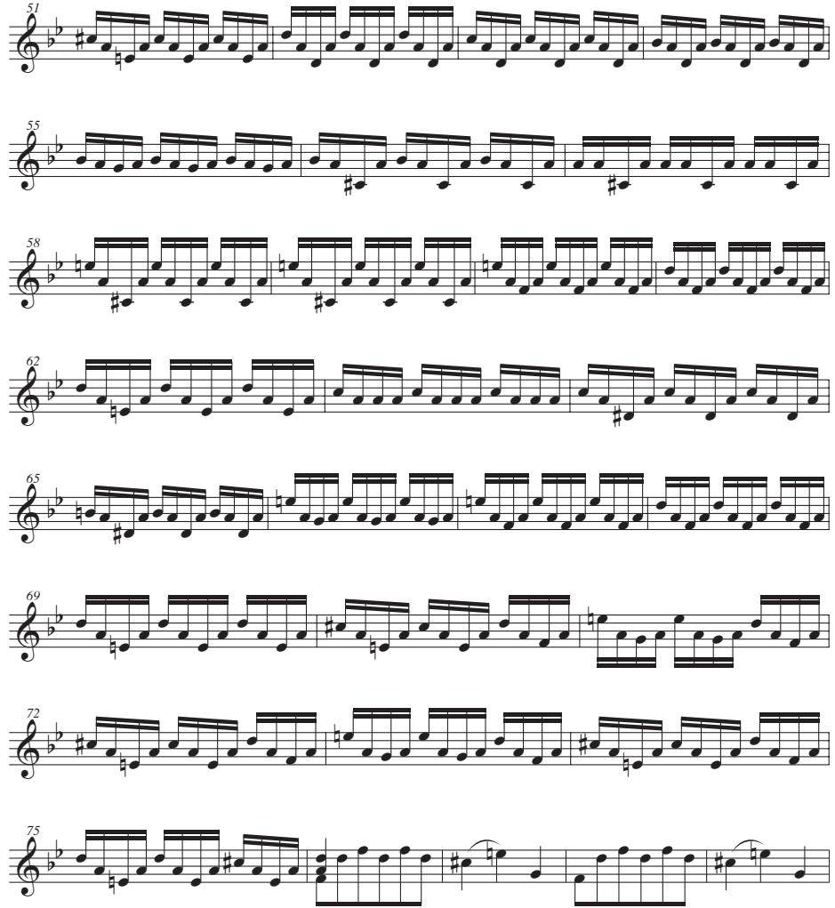
Figure 5: Vivaldi arpeggios from the Violino Principale of op. 8, no. 8, Allegro