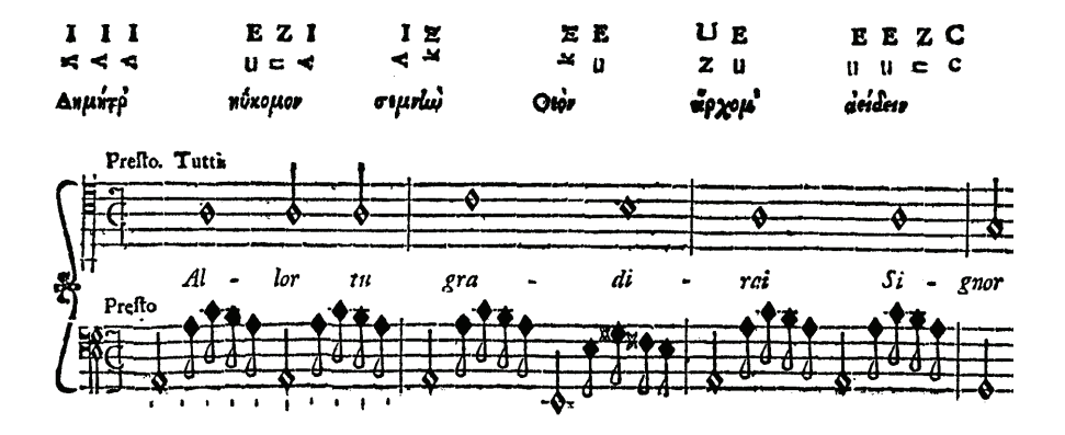
Example 1: Greek model for the verse "Allor tu gradirei, Signor" in Psalm 18.

legorically in the text, while brutally long strings of whole notes convey the insistent voice of God in this and several other cases. Also in the verse "Allor tu gradirei, Signor", derived musically from Homer's [incompletely preserved] "Hymn to Ceres" in Psalm 18 (Example 1), the articulation marks in the bass part show a frequent method of articulation used by Marcello, who was a cellist. The composer noted that the Greek model was a "diatonic genus of the Hypolydian mode".