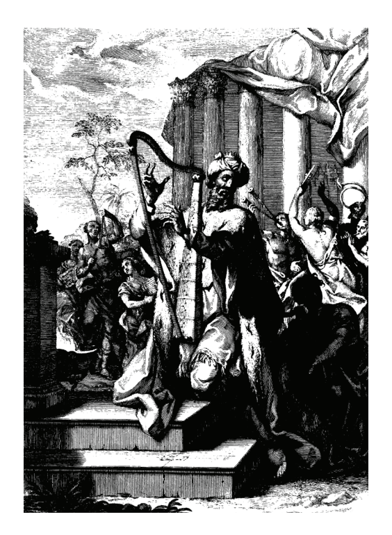
Illustration 1: Giuseppe Camerata's depiction of songs of praise provided by King David (Books 1 and 5 of the Salmi di Davide ).