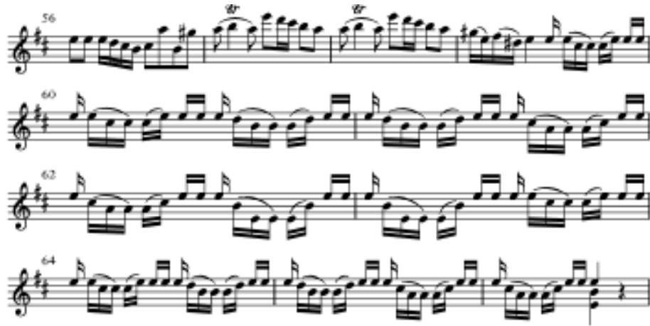
Figure 7. Unusual style of bowing indicated in Violino Principale of the first movement of Vivaldi's Op. 8, No. 11.

Vivaldi clearly differentiates between the open E string (shown in the original with a slash across the stem) and the stopped A string (on which many E's are also played). This passage is arguably one which at another time could have been indicated by a chordal shorthand for bariolage, although the details of execution would be entirely obscured. In the related area of scordatura notation, Vivaldi sources are inconsistent.