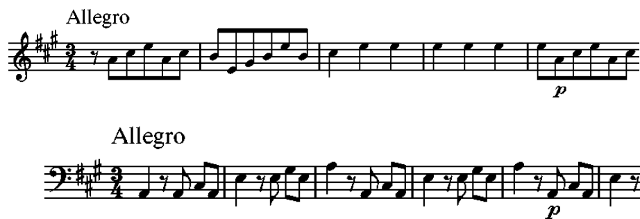
Figures 5b and 5c. Violino principale and Violoncello from the third movement of Vivaldi's Violin Concerto Op. 3, No. 5 .

Even in this relatively simple texture we see immediately that the transcription is not consistently a skimming off of treble and bass but instead the product of a more complex process of selection, reflecting in part the alternation between the violins in the orchestral model.