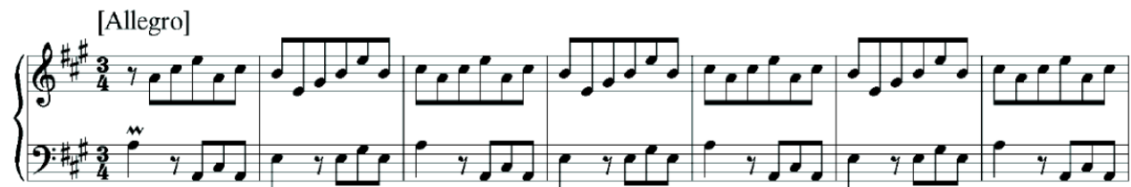
Figure 5a. Transcription for clavichord of Vivaldi's Violin Concerto Op. 3, No. 5, third movement , from Anne Dawson's Book .

After interpretation, performance options traceable to the composer offer another area of consideration by the encoder. It may be preferable to encode for different instruments, but it will depend on the degree of difference between the two versions. Bach's keyboard transcriptions of Italian concertos for violin and string orchestra illustrate a case in which two encodings are necessary. The quantitative note-for-note differences are extremely numerous because of changes to the texture of the music. Yet in sound reproduction, the cognitive similarity of the two instantiations would be very high. Bach is not necessarily illustrative of all keyboard transcriptions of instrumental music. In our Vivaldi corpus, the four concerti from Op. 3 which were transcribed for keyboard in an English manuscript known as Anne Dawson's book offer another useful model of the need for separate encodings: the texture is simplified rather than enhanced, but the ornamentation issues from the vocabulary of English keyboard music. The octave register is altered here and there in the transcription to suit both the mechanics and the sonority of the new instrument (Figure 5).