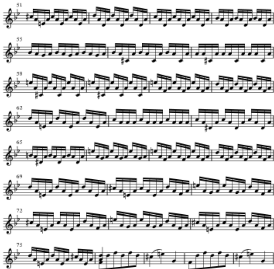
Figure 6. Vivaldi arpeggios from the Violino principale of Op. 8, No. 8, Allegro.

In the original print, Bars 51-75 are rendered as dotted half-note chords. There is no auditory evidence to prove that Vivaldi invariably recommended the down-down-up figuration. In many cases two possible melodic lines can be extrapolated from long series of “arpeggiation” chords. In other cases invertible figuration, or passages in which downward, upward, and mixed-direction arpeggios produce the most musical result (that is, the one most in keeping with voice-leading practices of the time).