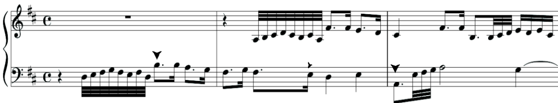
Figure 3. J. S. Bach: Fugue in D Major from Book I of the Well-Tempered Clavier (1722).

Another feature of the MuseData encoding system addresses the discrepancy between what is literally written and what should be understood in a “sound” interpretation of a MIDI file. A recurrent area of attention is the dotted note. In the case of French double-dotting, the widely subscribed view is that in the “French overture” style, the single dot was really a double dot and the complementary sixteenth note which followed was really a 32 nd . A well known example occurs in the D-Major Prelude of Book One of the Well-Tempered Clavier (Figure 3).