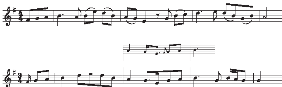
Example 2a, b.

First strains of (a) the Londonderry Air and (b) "The Young Man's Dream" (Dublin, 1793), with an alternative reading from a manuscript source.