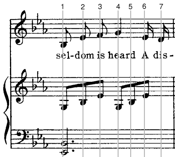
Figure 5: The example measure of music showing moment numbers.

To perform searches involving simultaneity, the query for each part is performed separately, and then the results are intersected based on their moments. Only the query results that occur at the same time (existing in the same moment regions) will be presented to the user.