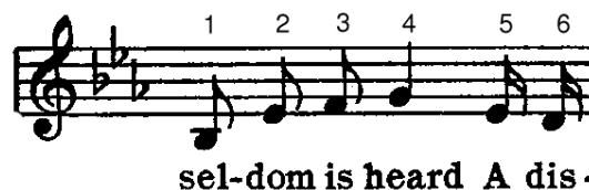
Figure 3: A measure of music, from the Levy collection, used as an example throughout this section. (Guion, D. W., arr. 1930. "Home on the range." New York: G. Schirmer.)